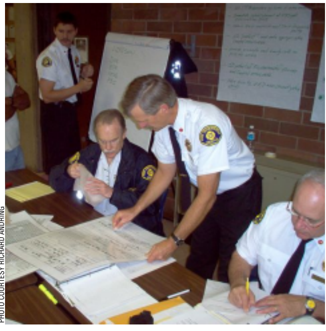
Leaders from the Seattle Fire Department and the Seattle Police Department train together regularly to establish and review a common set of response objectives for both everyday and large-scale incidents.

The SFD has applied NIMS concepts and processes in its dayto-day responses, its planning efforts for such annual events as the