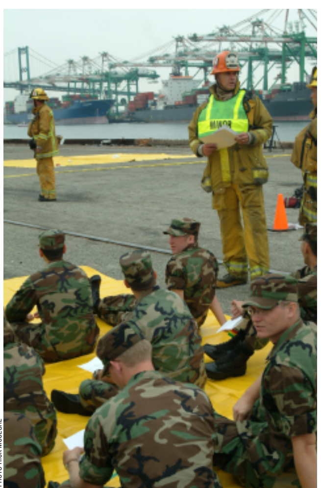
Field exercises are essential for preventing disconnect between agencies during a real-life incident. Such training can also help first responders understand why it's so important to master NIMS/ICS concepts.

Clearly, fire, EMS and law-enforcement personnel had received some level of NIMS/ICS training. Equally as clear: They had not trained together, and their approach and implementation of NIMS/ICS was parochial at best.